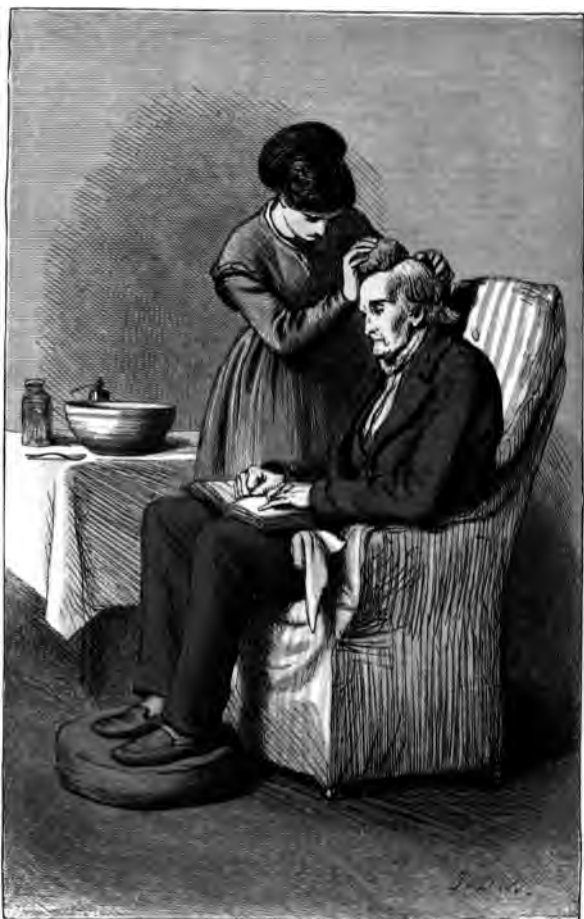
"But she is continually pulling out and shaking up his pillows, buckling his head in hot vinegar, and soaking his feet." — Page 382.